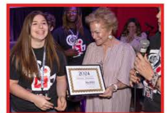
A Friend of Film - $6,000