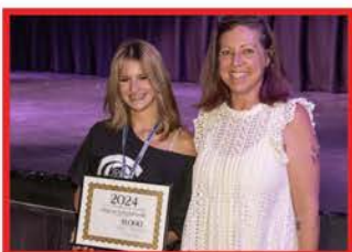
Lilac Foundation - $1,000