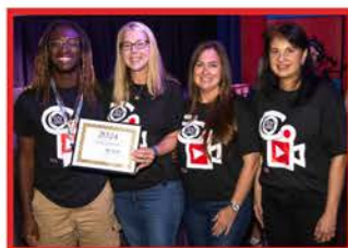
All About You Real Estate - $1,500